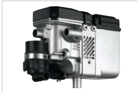
Thermo Top C Motorcaravan

The circuit of the heater can be connected with the hot water boiler of the vehicle