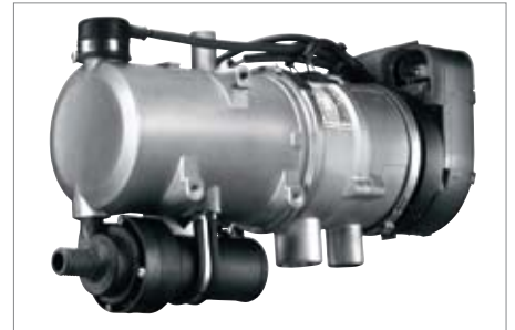
Thermo 90 ST